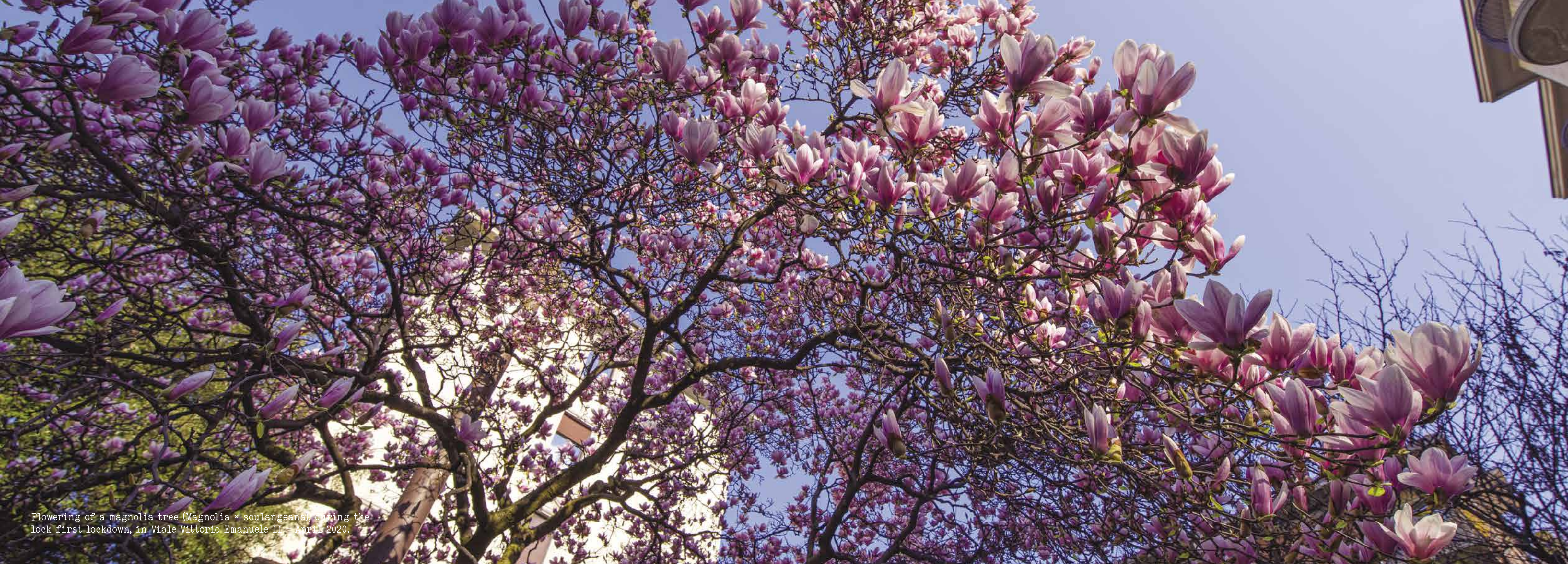
Flowering of a magnolia tree ( Magnolia × soulangeana ), during the lock first lockdown, in Viale Vittorio Emanuele II - April 2020.