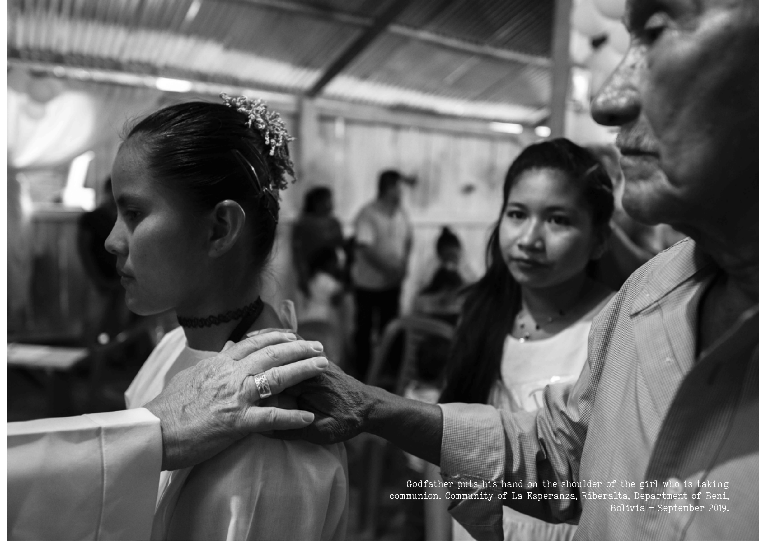
Godfather puts his hand on the shoulder of the girl who is taking communion. Community of La Esperanza, Riberalta, Department of Beni, Bolivia - September 2019.

In recent years he has traveled to Mexico, India, Nepal, Indonesia, Laos, Thailand, Jordan and the Bolivian Amazon.