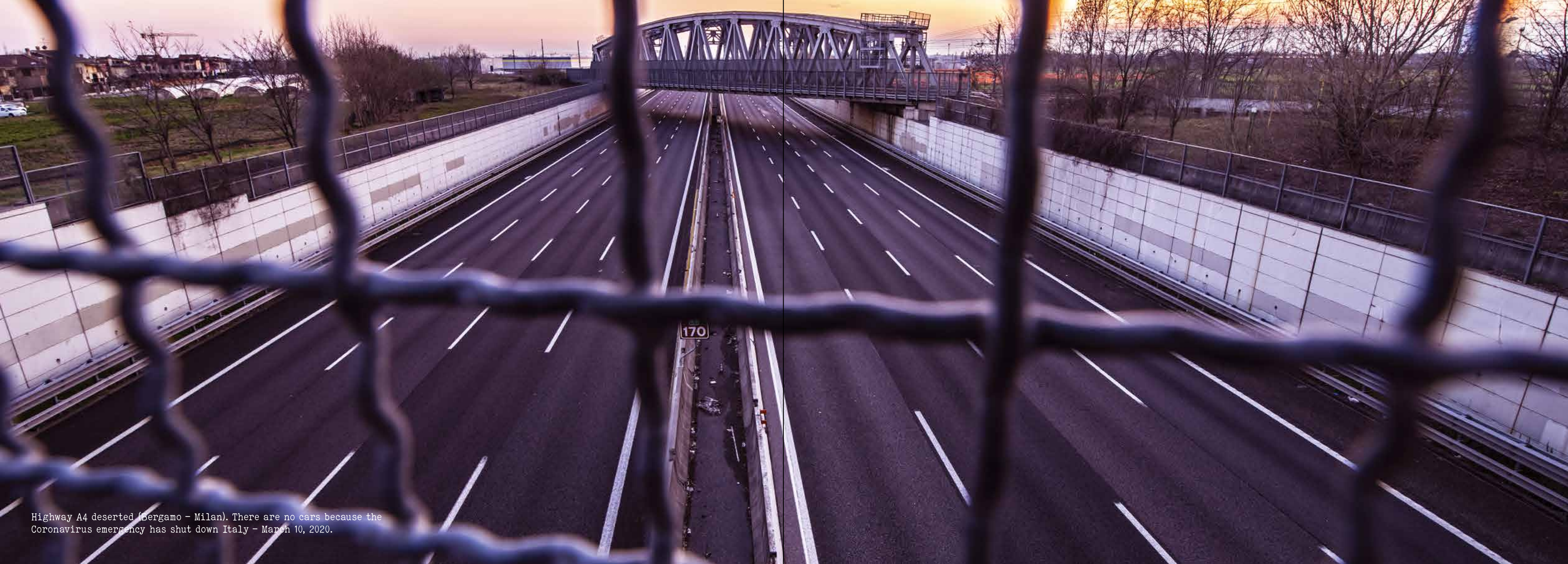
Highway A4 deserted (Bergamo - Milan). There are no cars because the Coronavirus emergency has shut down Italy - March 10, 2020.