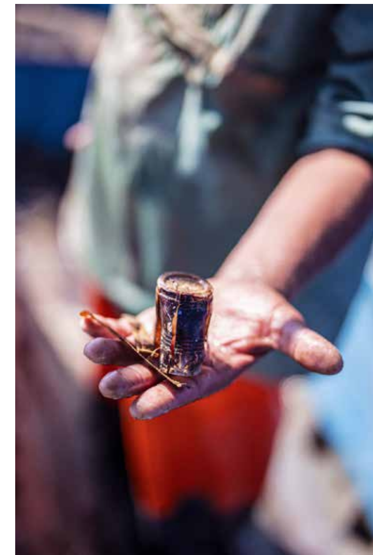
Fisherman holds a plastic cup in his hands that got stuck in the nets, Scario, Campania, August 2019.