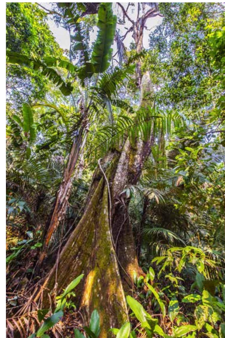
Bolivian Amazon rainforest – September 2019.