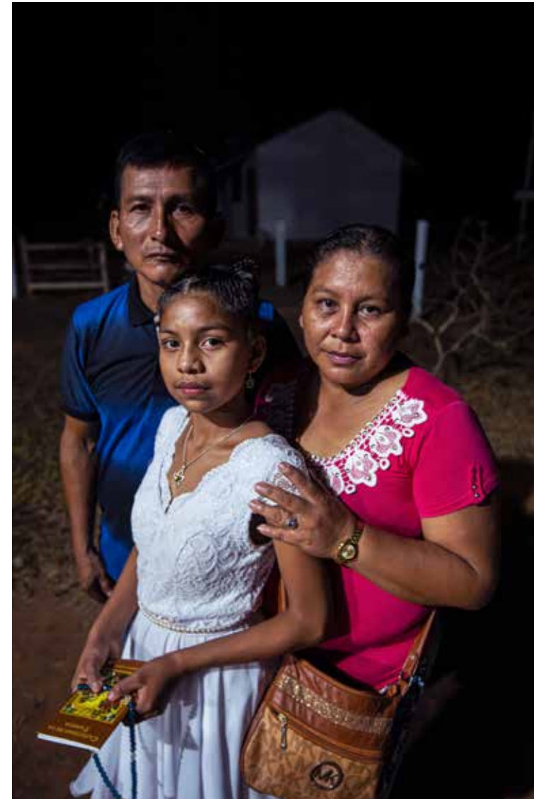
Family of Bolivian natives outside the church, after the mass is over – Amazon area of Rio Negro, northern Bolivia – end of September 2019.