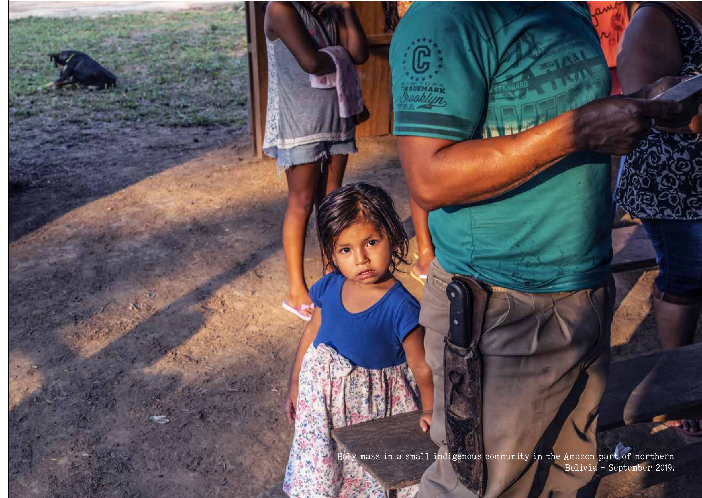
Holy mass in a small indigenous community in the Amazon part of northern Bolivia - September 2019.

With the material produced during the week spent in the Rio Negro area, accompanying a Brazilian nun and her assistant, he created the reportage "Mater", which was exhibited in the OFF section of the Photojournalism Festival of Ethical Photography in Lodi, Italy , edition of 2021.