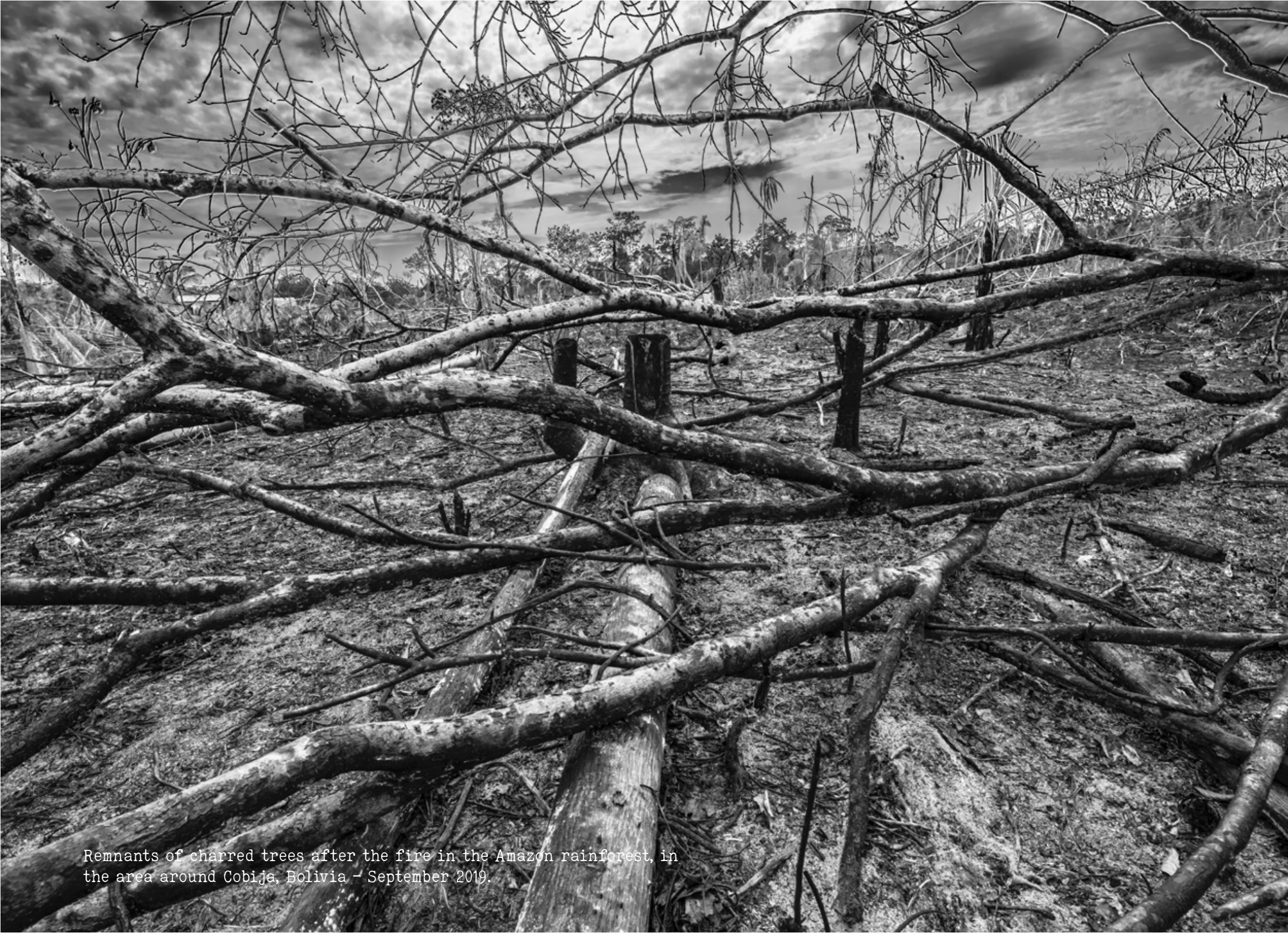
Remnants of charred trees after the fire in the Amazon rainforest, in the area around Cobiya, Bolivia - September 2019.