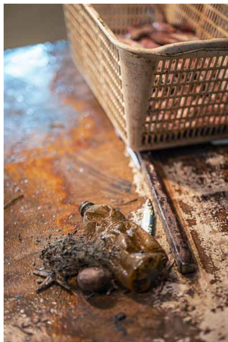
Plastic bottle, starfish and sea urchin, got entangled in the nets during the "fishing for litter" activities in Porto Garibaldi, Ferrara – 2019.