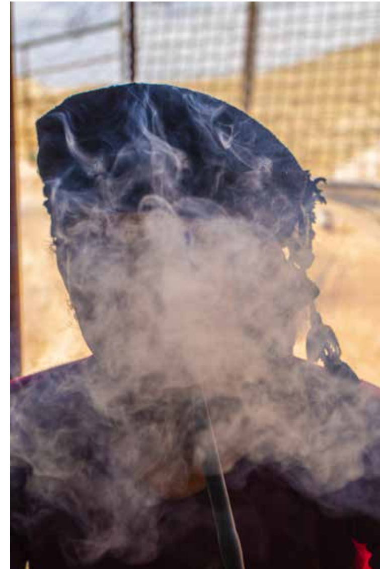
Portrait of a Jordanian desert man, outside his cave, near the archaeological site of Petra. 2019.