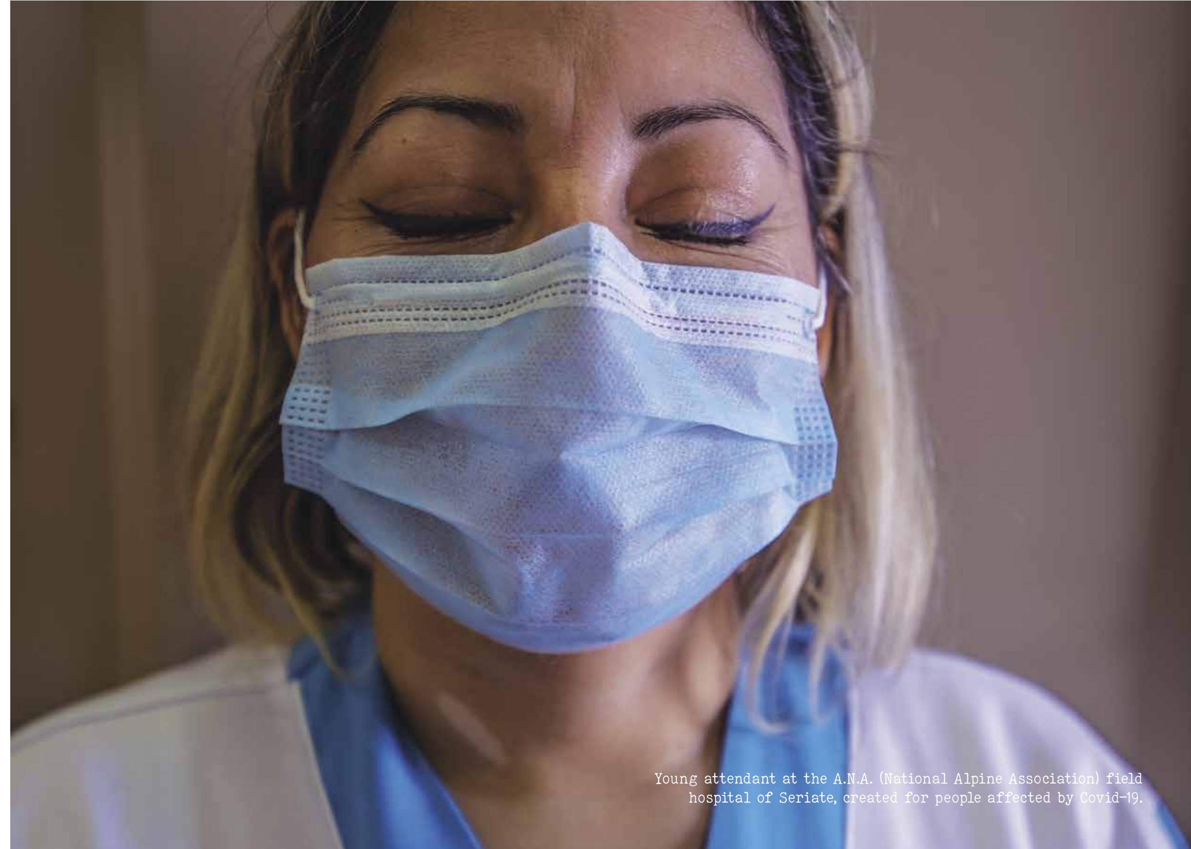
Young attendant at the A.N.A. (National Alpine Association) field hospital of Seriate, created for people affected by Covid-19.

From the summer of 2021 he collaborates with the monthly magazine Orobie.