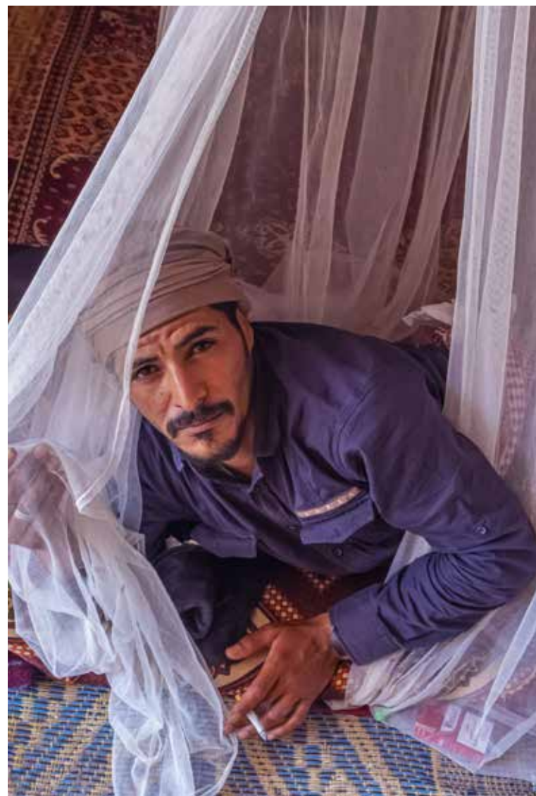
Bedouin man, inside his small shop, in the highest area of Little Petra – June 2019.