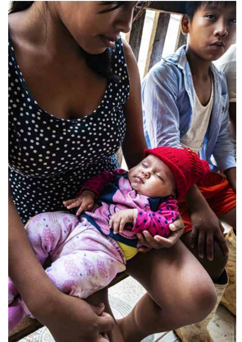
Indigenous woman with child during mass, in a Bolivian Amazon forest village – Rio Negro area – September 2019.