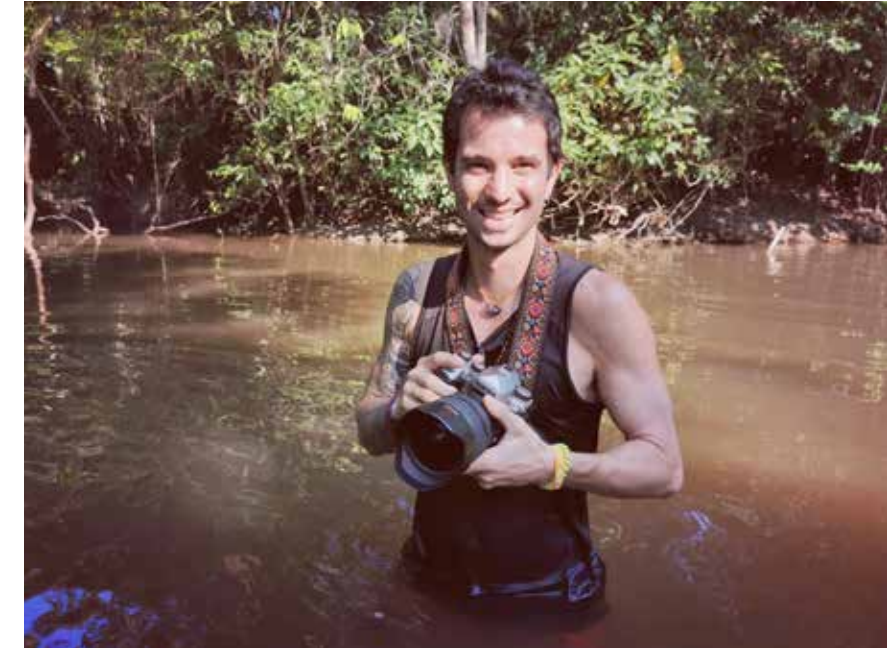
Amazonia, Vicariate del Pando, Northern Bolivia, October 2019.