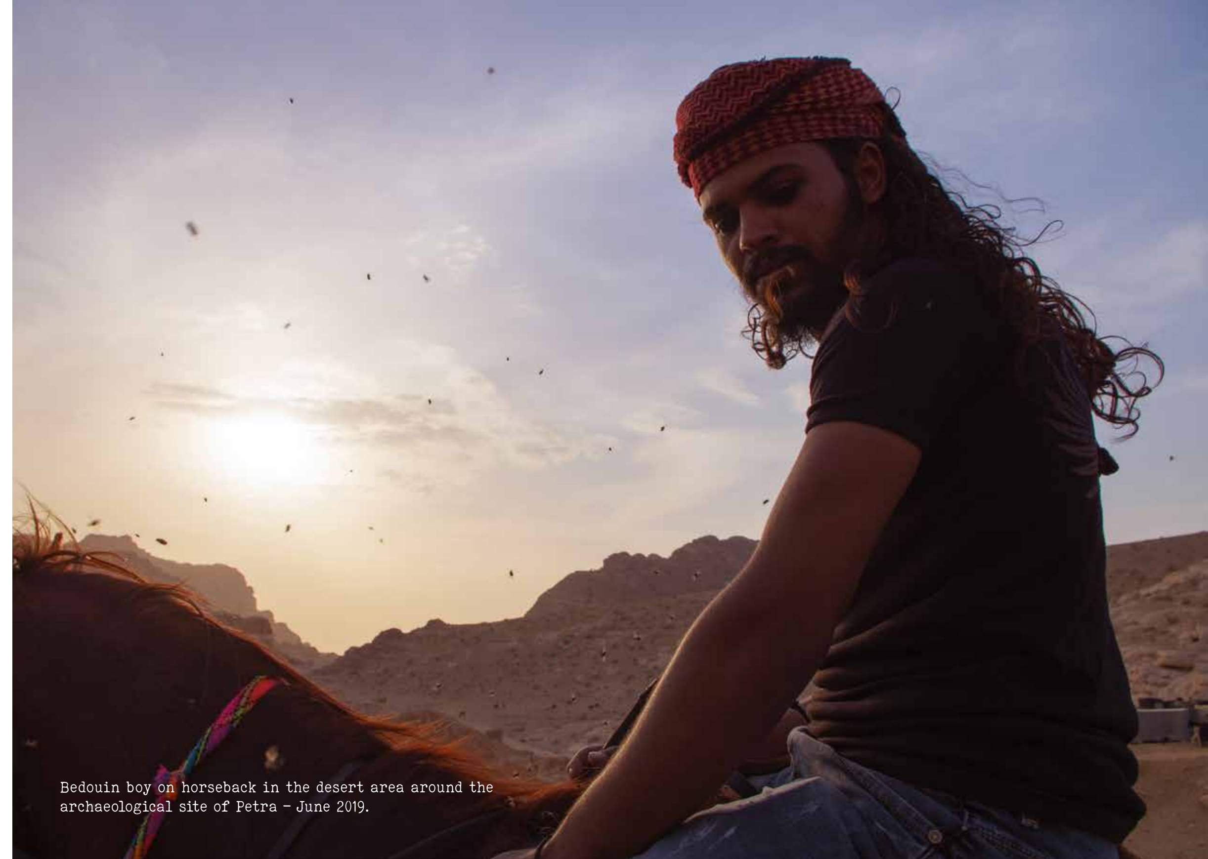
Bedouin boy on horseback in the desert area around the archaeological site of Petra – June 2019.

From my point of view, I believe this is the highest goal of creativity and art."