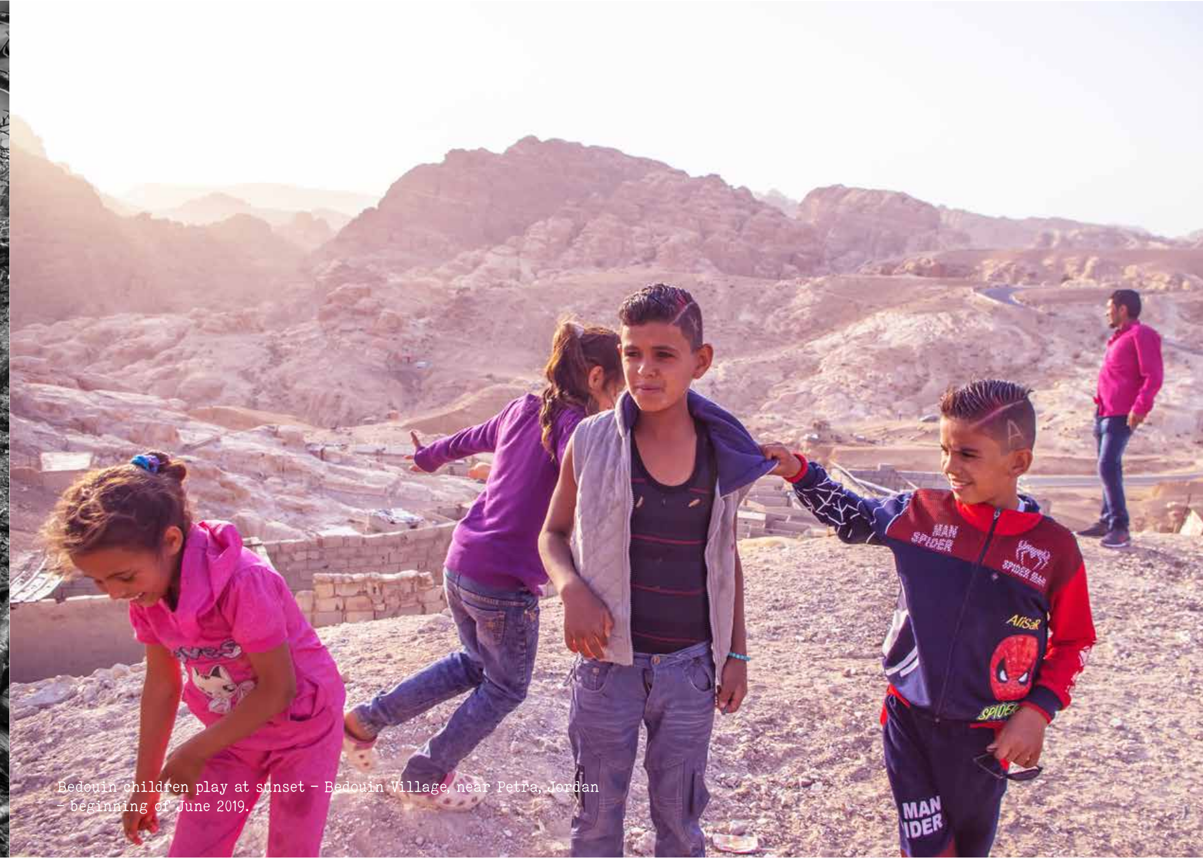
Bedouin children play at sunset - Bedouin Village, near Petra, Jordan - beginning of June 2019.