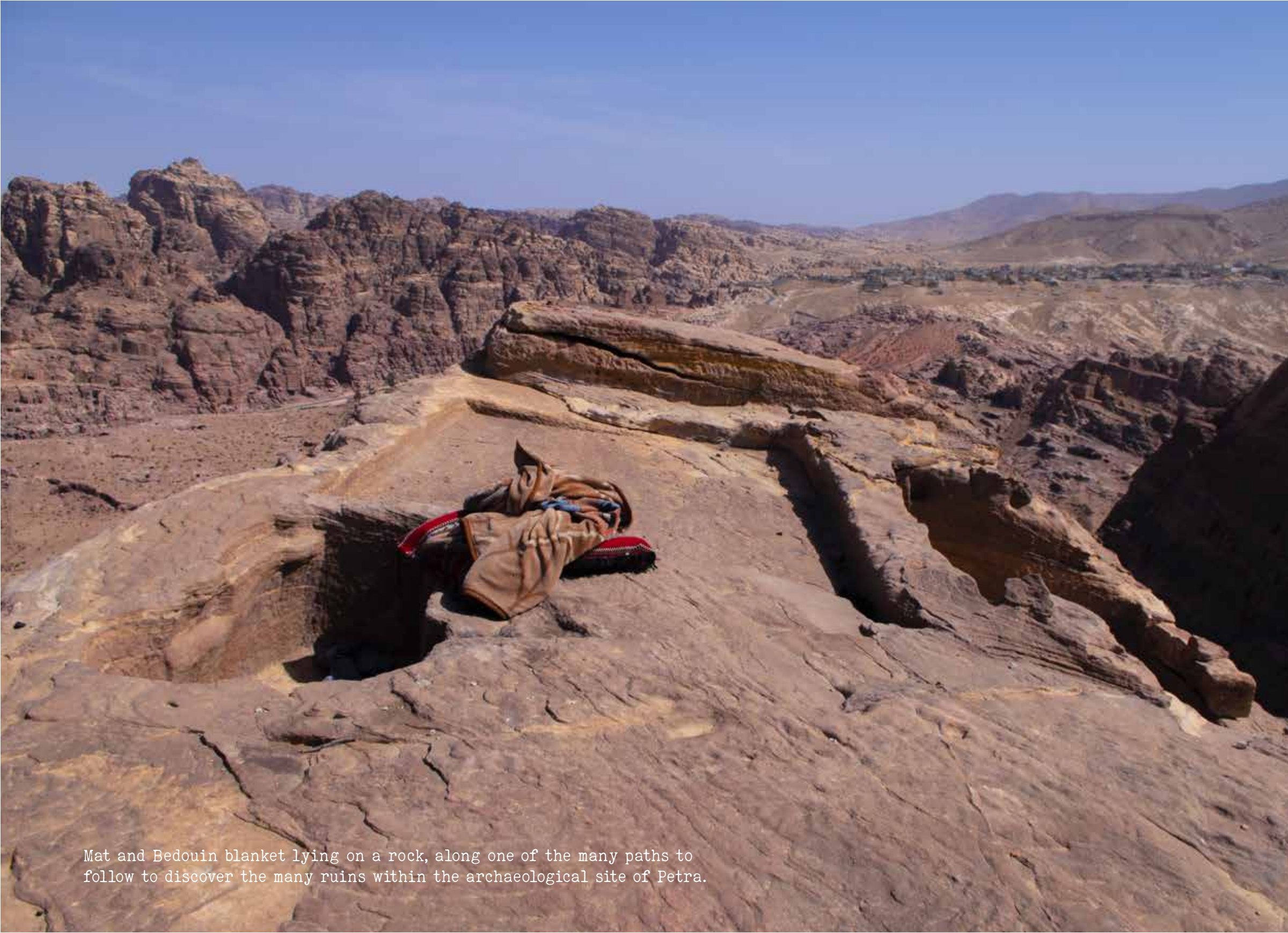
Mat and Bedouin blanket lying on a rock, along one of the many paths to follow to discover the many ruins within the archaeological site of Petra.

From 2019 he began to document the initiative of Legambiente - Italian environmental association - "Zero plastica in mare" and sponsored by BNP Paribas, for which fishermen collect waste from the sea during fishing trips, then disposing of it on land.