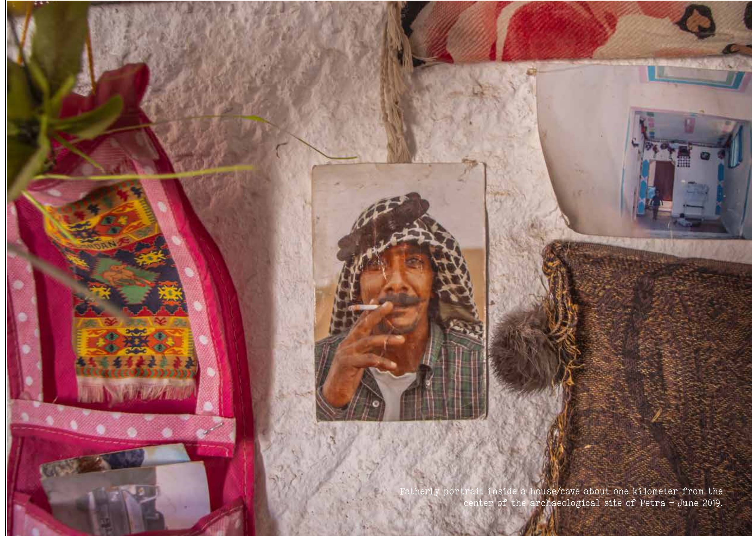
Fatherly portrait inside a house/cave about one kilometer from the center of the archaeological site of Petra - June 2019.

I write to accompany the images, to accentuate their poetry and communicative capacity, where the visual part, even with all its power, cannot reach."