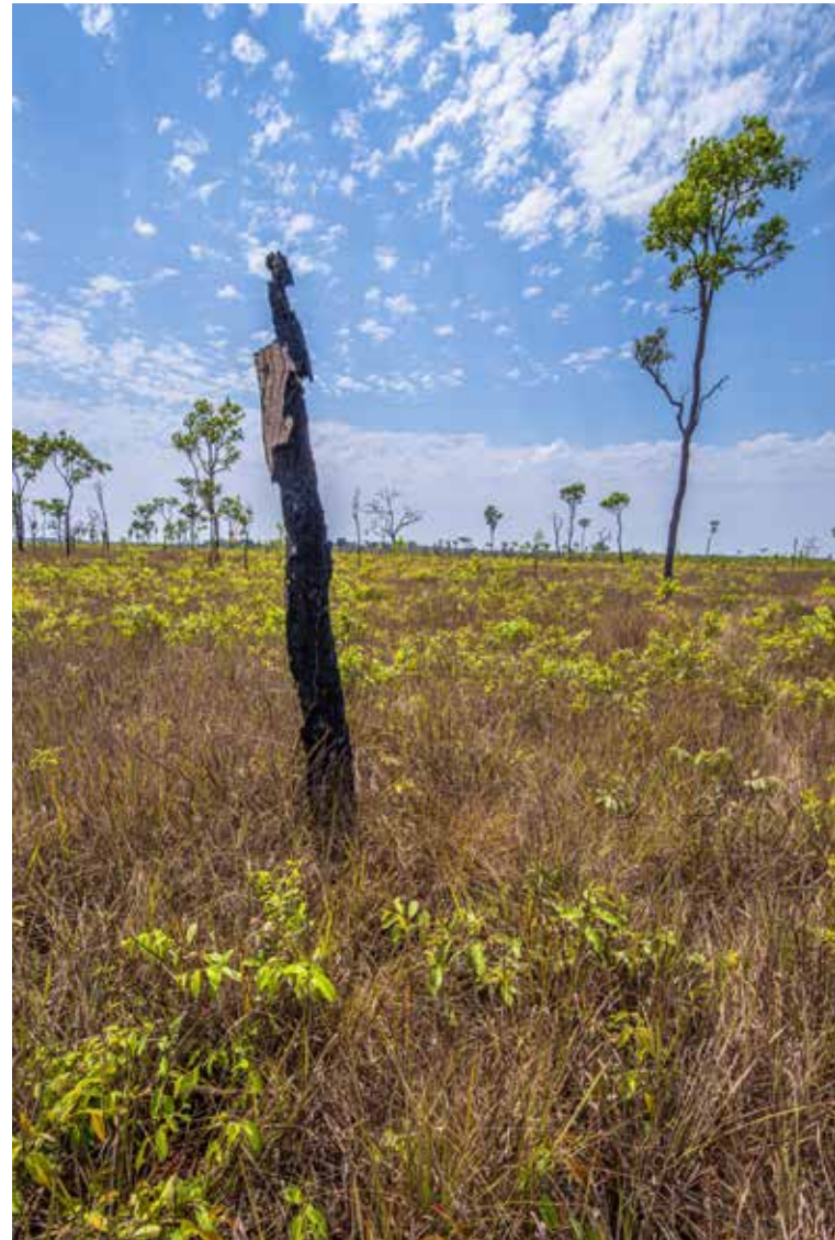
Remains of a tree after the fire in the Amazon rainforest in the area around the city of Riberalta, Bolivia – end of September 2019.